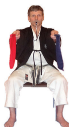
Maai ga toi Improper distance