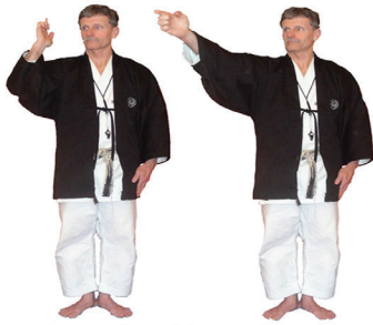
Jogai hansoku Contestant(s) out of match area - disqualification