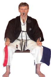
Yowai Weak attack