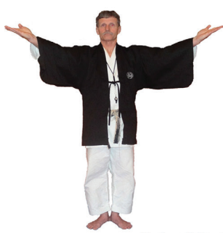
Fukushin shugo Request for Judges' conference