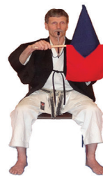
Ukete Iru Blocked technique