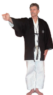
Hansoku chui Warning