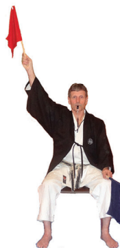
Ippon Perfect scoring technique