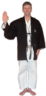
Taiming ga osoi Improper timing