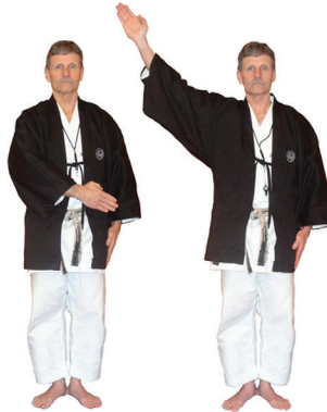
Ippon Perfect scoring technique