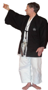
Aka (Ao) shikaku Red (Blue) side is disqualified