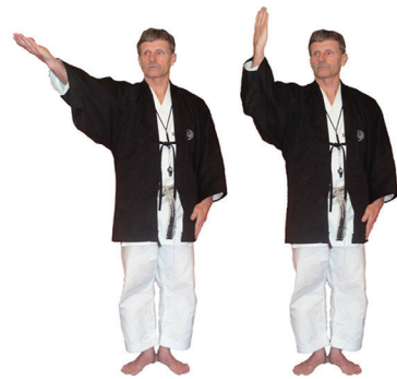
Fukushin shugo Request for a single Judge conference