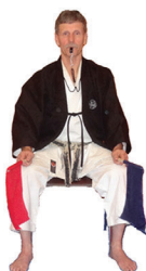
Shobu Ippon Hajime One point match - Begin