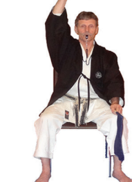
Hansoku Chui Warning (small circles)