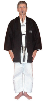
Hantei Notifying Judges' to prepare to display their decisions