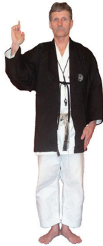
Jogai keikoku Contestant(s) out of match area - 1st warning