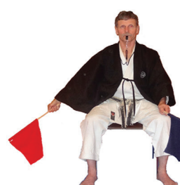
Jogai Contestant(s) out of match area