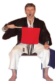
Nukete Iru Technique off target