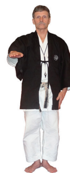
Yowai Weak attack