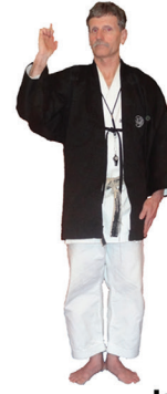
Jogai chui Contestant(s) out of match area - 2nd warning