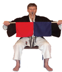
Aiuchi Simultaneous techniques