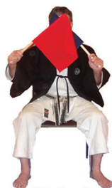
Meinai Could not see