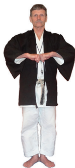
Aiuchi Simultaneous techniques