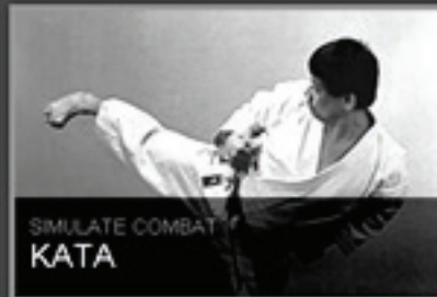
SIMULATE COMBAT KATA