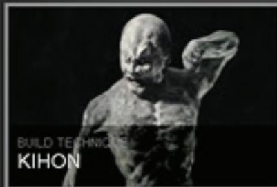
BUILD TECHNIQUE KIHON