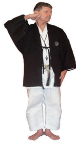
Mubobi Non-defending Disqualification