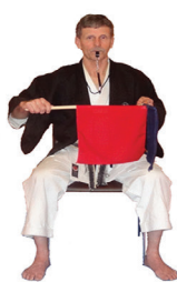
Hayai Faster technique